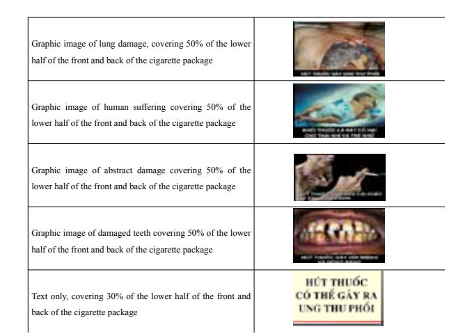
Figure 1. GHW Designs Used in this Study

To predict the impact of GHWs on the reduction of premature smoking-associated deaths as a result of GHWs, we constructed different static models. We adapted the method developed by University of Toronto, Canada (Used in the research "Tobacco Taxes: A Win-Win Measure for Fiscal Space and Health" (Asian Development Bank, 2013)). We evaluated the impact of different GHW labels on cigarette packaging on reducing the number of smokers. The reduction in the number of smokers was then converted into prevented smoking-related mortality. The prediction exercise was conducted in two steps. The parameters and assumptions used in the prediction are